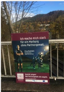
Photo 3: In addition, there were of course press releases and conferences, a radio interview, an episode in the podcast "Hörmal Marburg", where we drew attention to the project and its goals.

Photo 2: The first shooting for the photo campaign was filmed for the reportage format plan b on ZDF (public television).